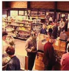
Revolutionising the way we shopped

PALMERS IS STILL PASSIONATE | about helping kiwis | Grow Great GARDENS