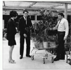
A bit dressed up for gardening